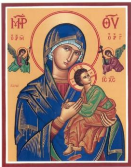
Our Lady of Perpetual Help