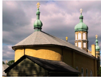
Church of St. Michael Mont Clare, PA

There are often people who have been raised as Byzantine Catholics and through the years have become separated from the Church. Perhaps there has been someone in your family or, your friends or neighbors who were raised Byzantine Catholic but, no longer actively participate in a parish. Please invite your friends or, those who used to be a member of our parish to come and enjoy again our parish family. Remember, together we can accomplish everything! Sharing with one another always increases joy and diminishes sorrow! Welcome Home!!