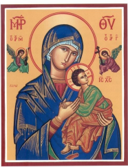
Our Lady of Perpetual Help