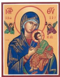
Our Lady of Perpetual Help